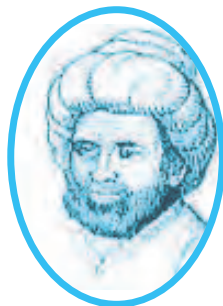
Muhammad ibn Musa al-Khwarizmi (C.E. 780 – 850)

A lemma is a proven statement used for proving another statement.