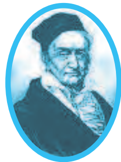
Carl Friedrich Gauss (1777 – 1855)

Carl Friedrich Gauss is often referred to as the 'Prince of Mathematicians' and is considered one of the three greatest mathematicians of all time, along with Archimedes and Newton. He has made fundamental contributions to both mathematics and science.